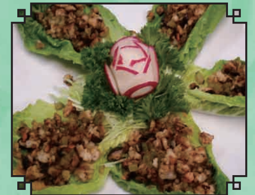
S17. Shrimp Lettuce Wrap