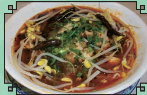
S24. Fish Filet with Bean Sprout in Spicy Sauce