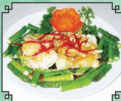
H12 Steamed Sea Bass