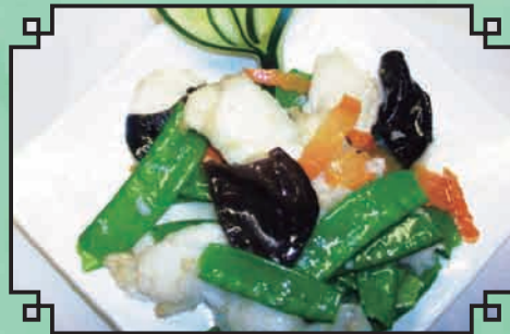
S27. Fish Filet with Spraw Mushroom in Scallop Sauce