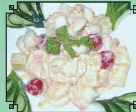
H8. Shrimp With Walnuts